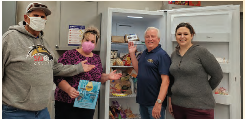
Granite City, IL — SOAR Chapter 7-34-2 recently enjoyed a well-organized, fun and very successful Trivia Night, raising over $4,000 to purchase a desperately needed refrigerator and a stand-alone upright freezer for the Good Samaritan House in Granite City. Five families can now have their own shelf and don't have to double up, sharing one as they had before our donation. Thanks to all who contributed!