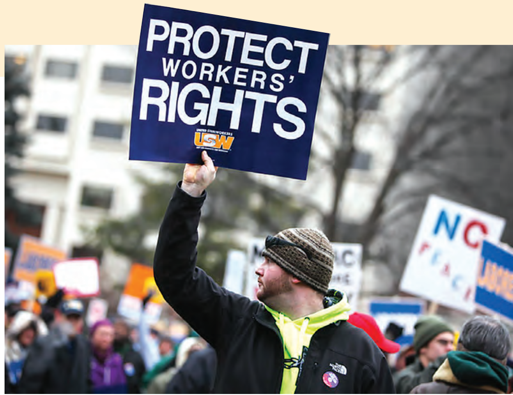
Photos of USW members rallying against anti-worker RTW legislation at the Michigan statehouse.