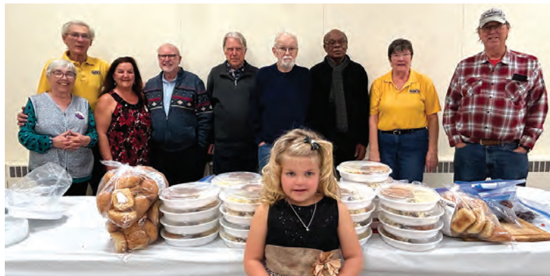
Pictured are the SOAR volunteers with the dishes of food to be delivered to the homeless, and with young, "Next-Gen" Ally in the foreground.

Not only was it a great holiday lunch, but with all the donations collected, it was a very rewarding experience for all who attended.