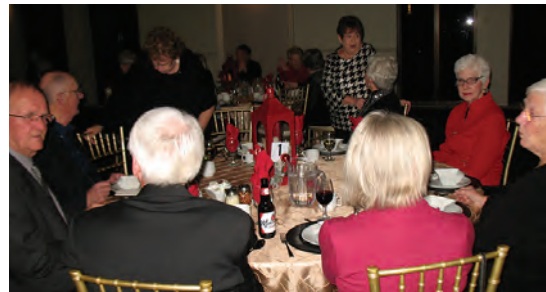
Some of the 94 members and guests who enjoyed the 2023 Christmas party hosted by SOAR Chapter 6-17.