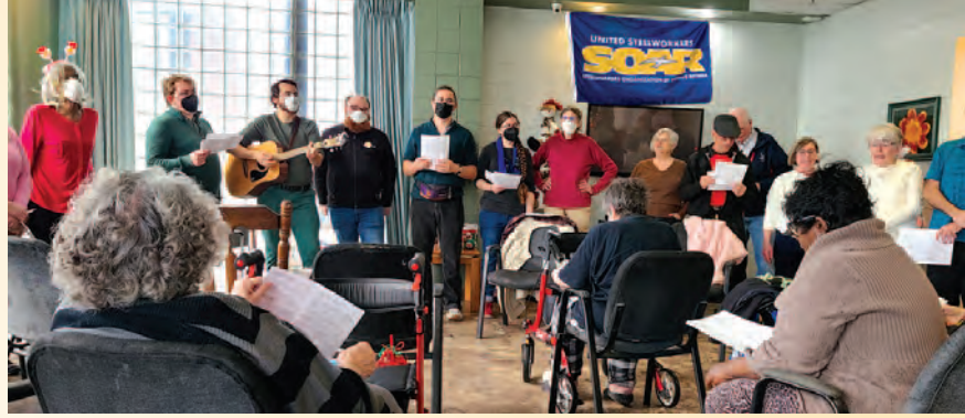
Pittsburgh, PA—Members of SOAR 20-15, Greater Pittsburgh Steelworker Retirees, and members of the Pittsburgh Labor Chorus singing in the holiday season at I. W. Abel Plaza.

SOAR members were still singing when they sat down for their holiday luncheon on December 2. They rang in the season at I. W. Abel Plaza, one of three affordable senior housing complexes in Pittsburgh where the USW is on the board of the Elderly Housing Development and Operations Corporation. It was not just Jingle Bells and dashing through the snow. Joined by the Pittsburgh Labor Chorus, retired steelworkers substituted union lyrics for holiday tunes. For example, to the tune of O Come All Ye Faithful, retirees sang, "O come to all ye readers, don't read the Post-Gazette. Rip up that paper and unsubscribe today." The region's largest newspaper workers have been on strike for over a year.