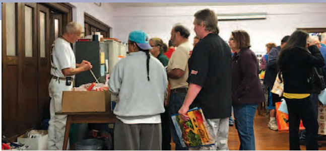
A volunteer instructor explains the importance of energy efficiency to watching participants at a local weatherization event.

available during power outages. A battery manufacturer in Pittsburgh that currently makes industrial storage batteries sees a vast market in these home storage devices. Employing hundreds of people. To the extent we