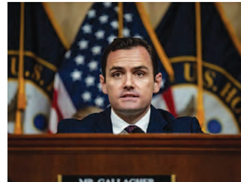
House Select Committee on the CCP Chairman Mike Gallagher (R-Wis.).